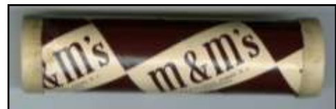
D. M&Ms for soldiers that doesn't melt in their hands