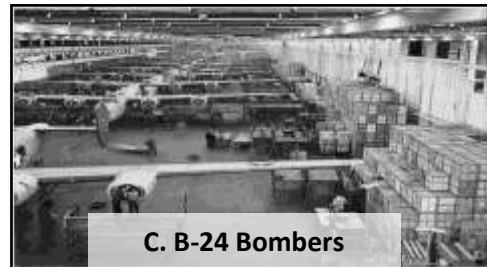
C. B-24 Bombers